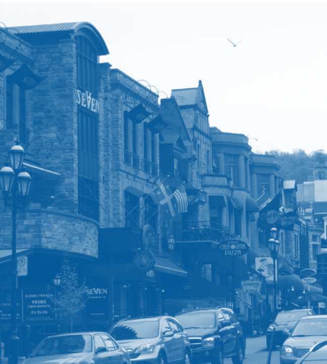
Montreal Street Scene

American Academy of Oral & Maxillofacial Pathology